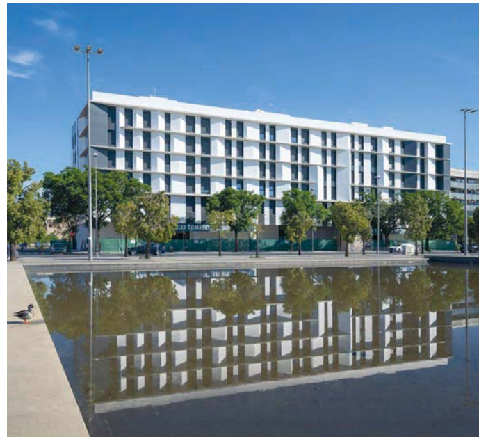
Vía Augusta - Córdoba