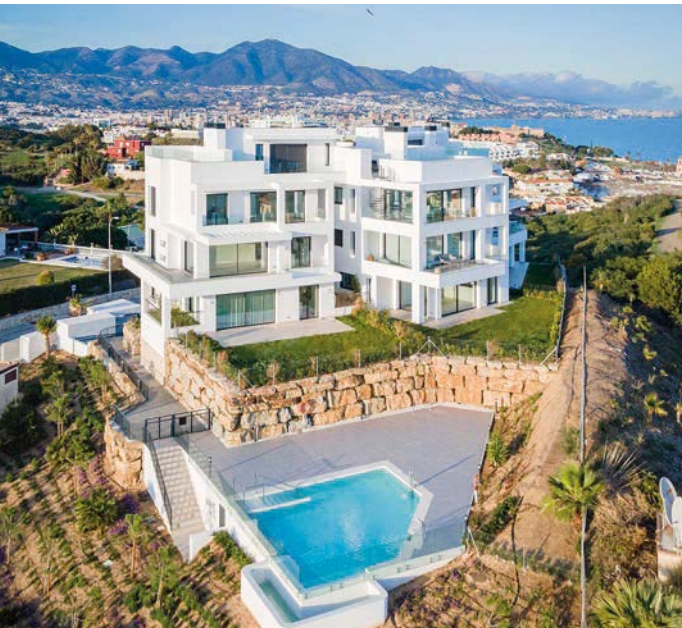
Residencial Monterrey - Mijas