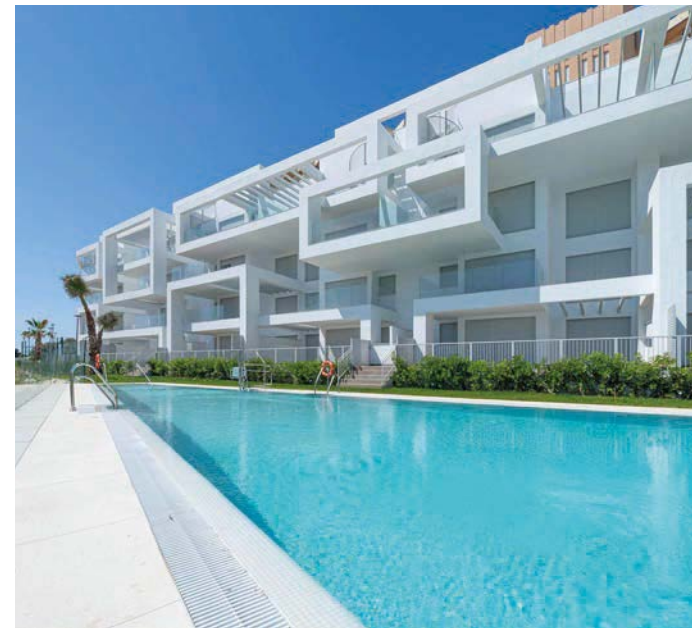
Residencial White Stones - Torremolinos